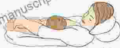
Laid-back hold (straddle hold)