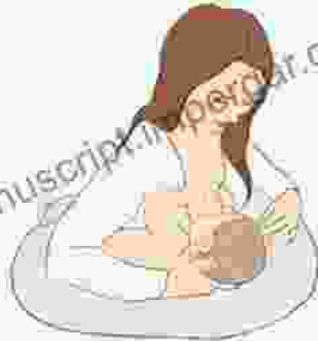
Clutch or football hold