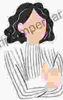
Cross-cradle or transitional hold