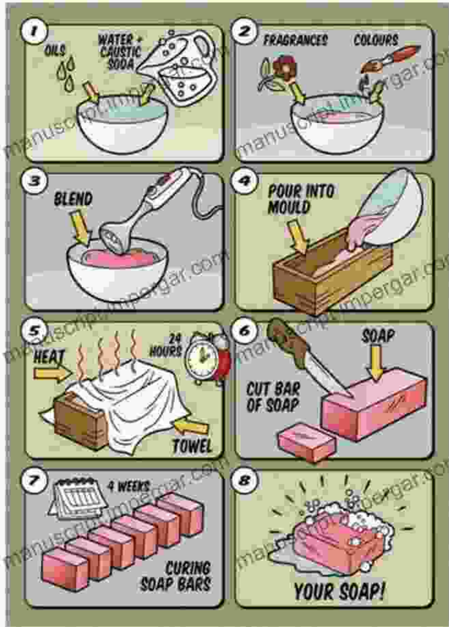
Step-by-Step Soap Making Process