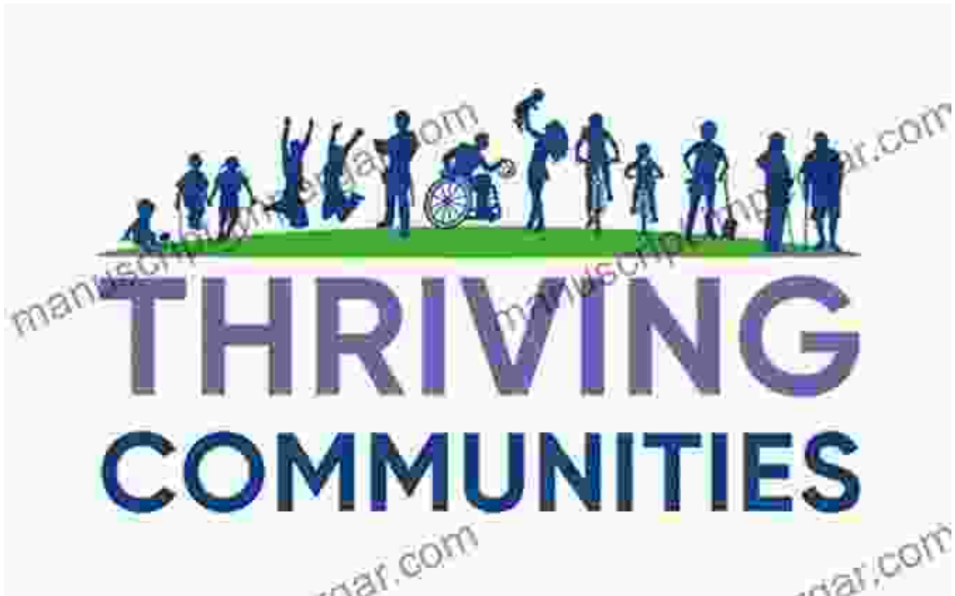
The Thriving Community of Astoria

strategically situated at the confluence of the Columbia and Willamette rivers, Astoria was born. The settlement, meticulously planned and diligently constructed, served as a hub for fur trading operations and a symbol of American presence in the region.