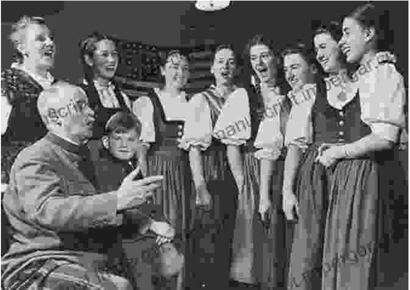
The von Trapp family, embarking on their journey to America